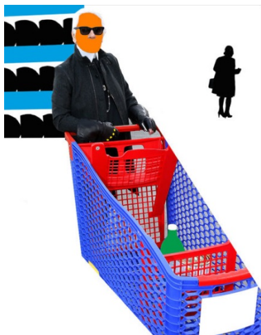
Karl Lagerfeld (JBA14-5379) 20-color screenprint 40 x 30 5/8" (101.6 x 77.8 cm)