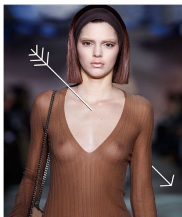
Valentine (JBA14-5381) 16-color screenprint 38 x 34" (96.5 x 86.4 cm)