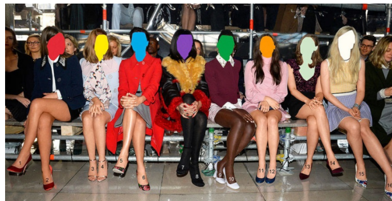
Numbered Legs (JBA14-5380) 20-color screenprint 21 x 43 1/2" (53.3 x 110.5 cm)