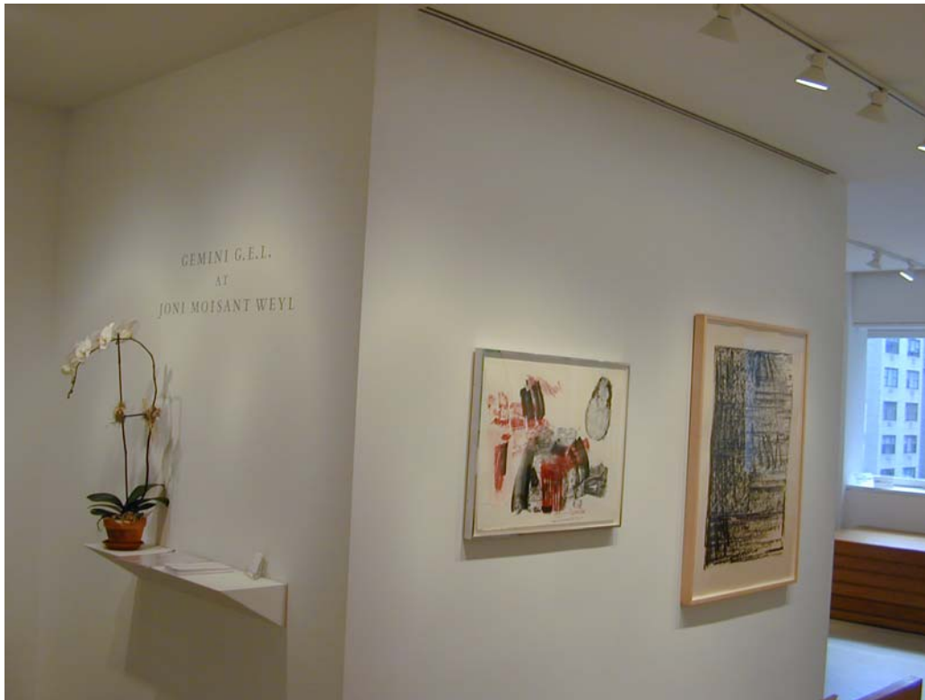
Left to Right: Robert Rauschenberg, Test Stone #3 1967, Jasper Johns, Two Flags 1981