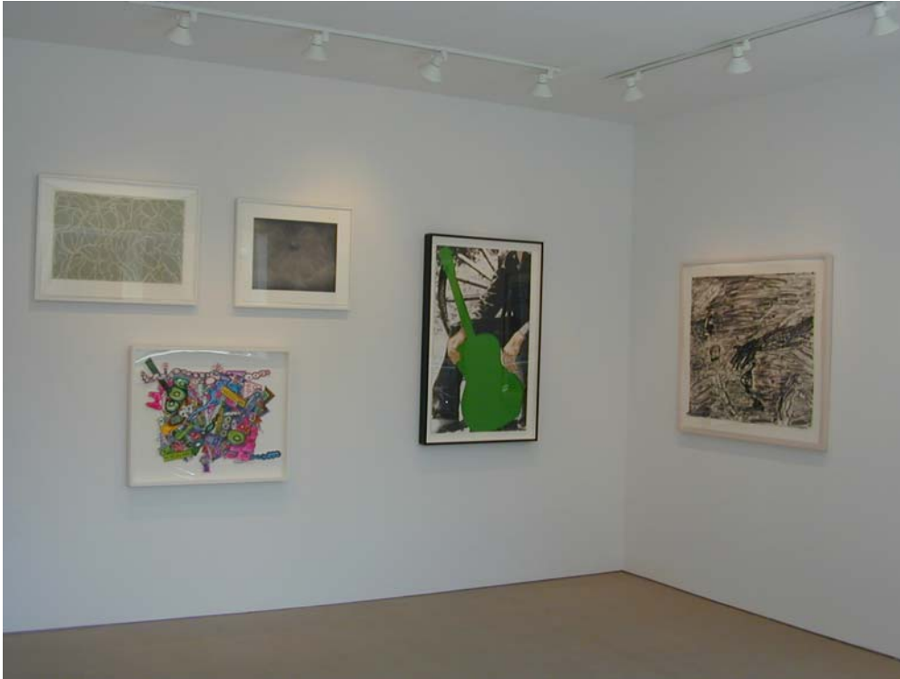
Left to Right: Brice Marden, Red Line Muses 2003, Vija Celmins, Night Sky I (Reversed) 2002, John Baldessari Person with Guitar (Green) 2004, Elizabeth Murray, Melrose 2004, Susan Rothenberg, Slip 2003