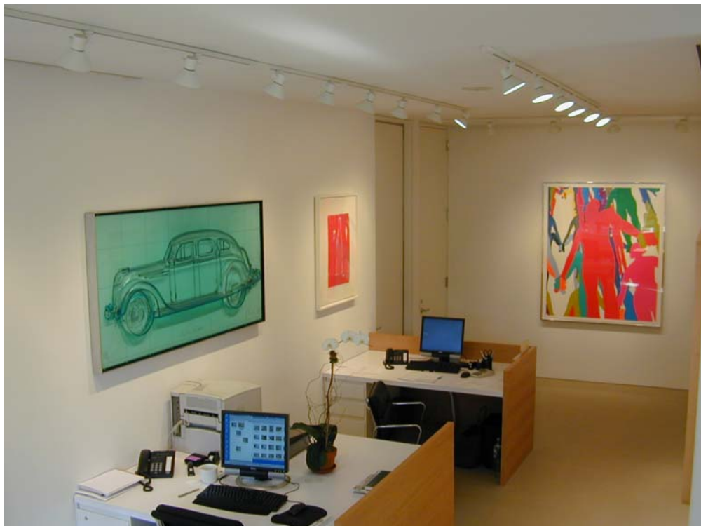
Left to Right: Claes Oldenburg, Profile Airflow 1969, James Rosenquist, Amusement Stops 1982, Jonathan Borofsky, Human Structures #1 2005