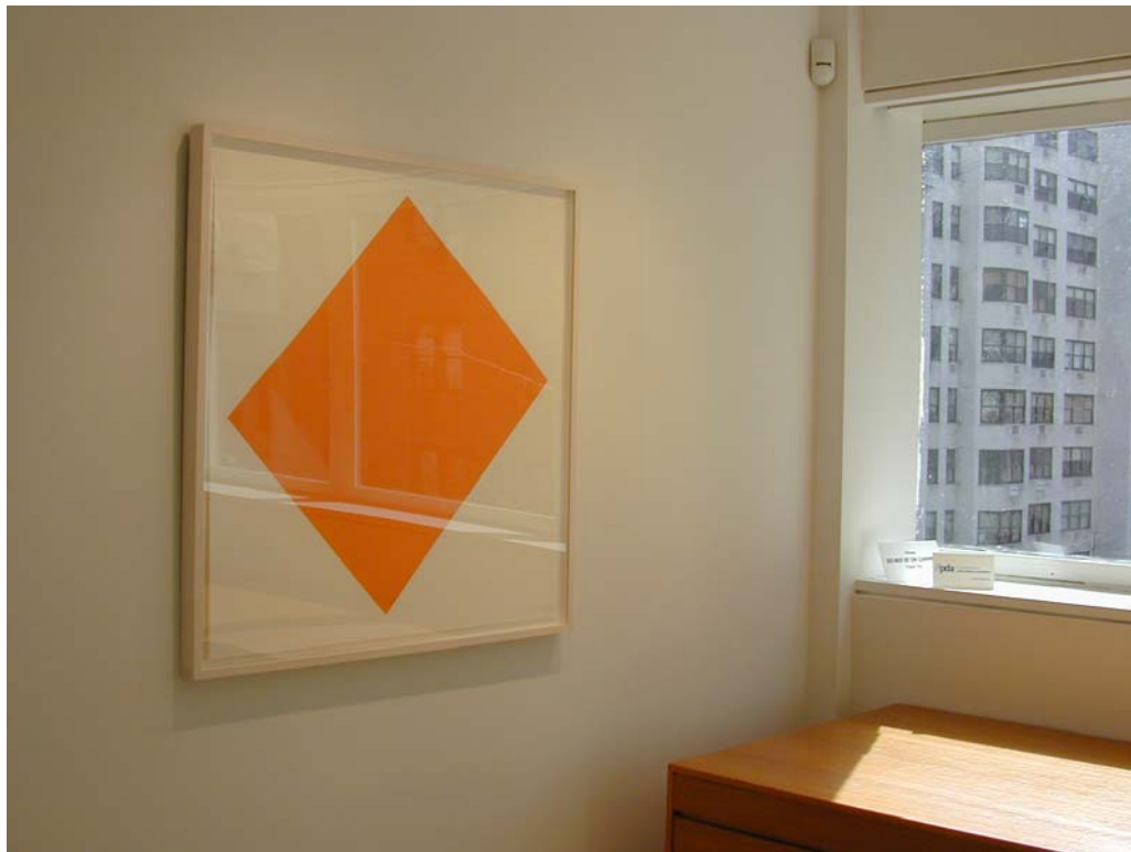
Ellsworth Kelly, Orange 2001