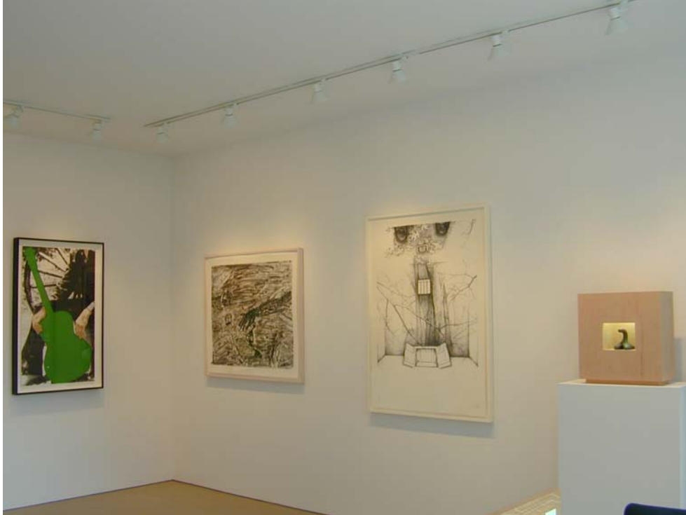
Left to Right: John Baldessari, Person with Guitar (Green) 2004, Susan Rothenberg, Slip 2003, Robert Gober, Untitled 2002, Ken Price, Curly 2005